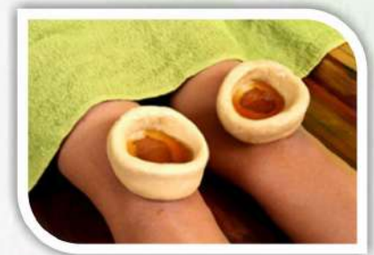
Janu Basti, Griva Basti, Kati Basti