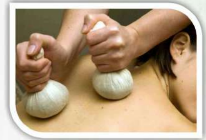
Shasthik Shaali Pind Swed