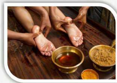
Massage and Steam Therapy